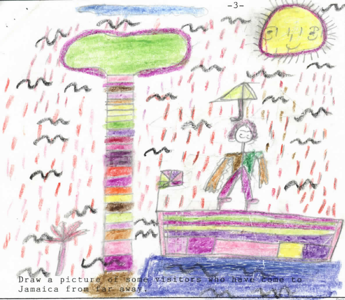
Draw a picture of some visitors who have come to Jamaica from far away.

I draw a tourist going out to the sea on a boat.